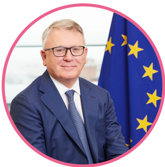
Nicolas Schmit, European Commissioner for Jobs and Social Rights

In Europe, we find ourselves in a period of transition. The green and digital transformations are essential for a sustainable future and bring both opportunities and challenges. We also aim to emerge stronger from the COVID-19 pandemic, using this transformational period to create new opportunities and jobs to boost Europe's recovery.